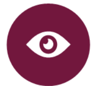
Integrated Threat Management