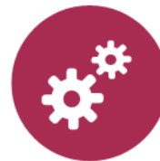
Efficient, Automated Operations